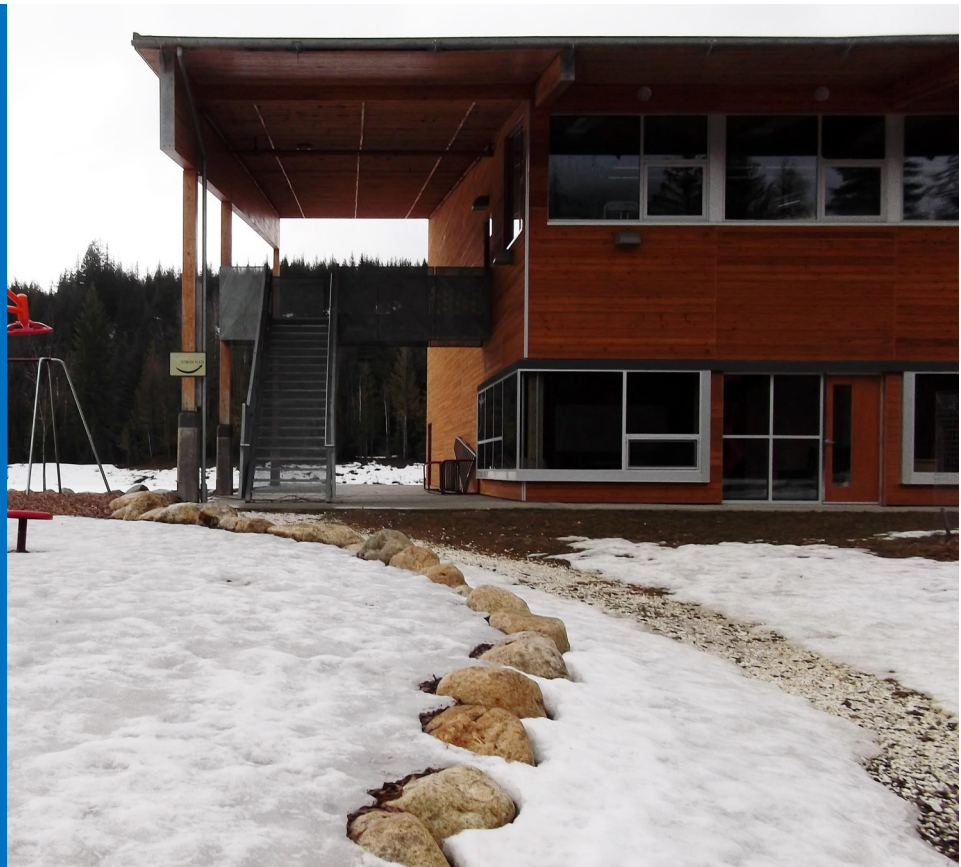
Crawford Bay New School, Interior and exterior finishing by A&A

It will be bigger, bolder and brighter than ever. Watch out for the new A&A Painting website!